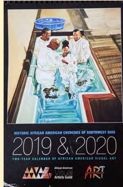
HISTORIC AFRICAN CHURCHES OF SOUTHWEST OHIO