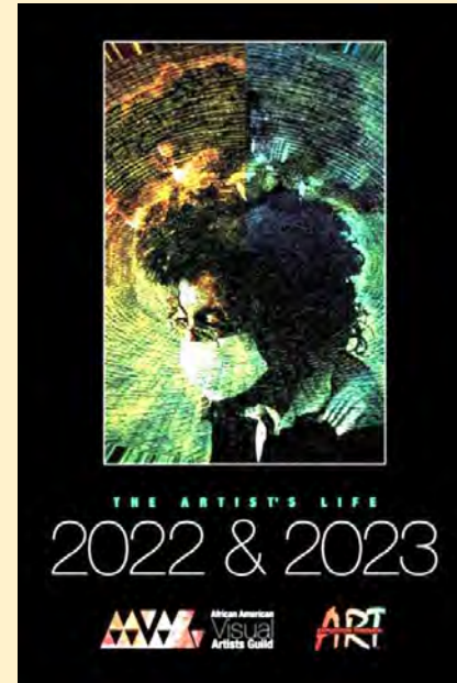
THE ARTIST'S LIFE