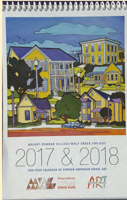
WRIGHT DUNBAR VILLAGE/ WOLF CREEK